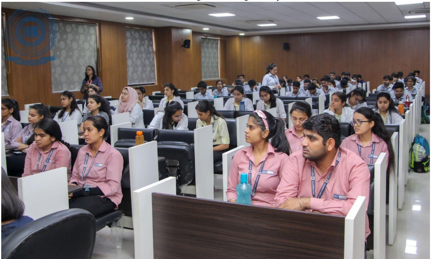
Students listening to another student presenting as per the suggestion of the resource person