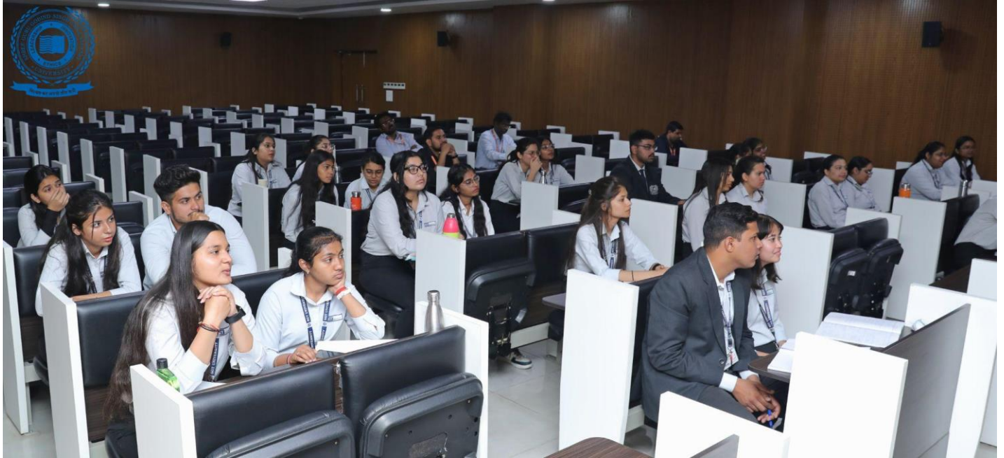
Students sitting and listening to the speaker